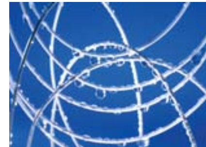
Close-up of membrane filter

Our ozone pilot plant helps to ensure that the most effective treatment processes are used to achieve high-quality drinking water.